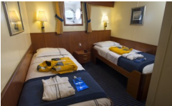
Main Deck Twin Porthole