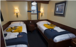
Main Deck Twin Window