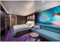
Superior - Sole Occupancy