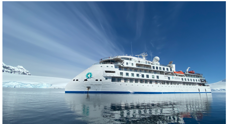
on Deck 5.