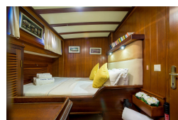
Single occupancy of Double Cabin