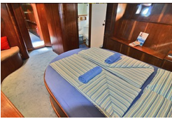
Single Occupancy Double Bed