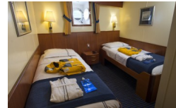
Main Deck Twin Porthole