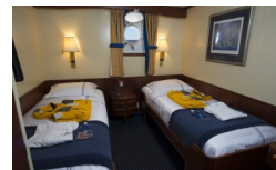
Main Deck Twin Window