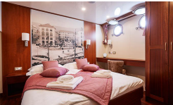
Above deck Cabins - From Lower Deck