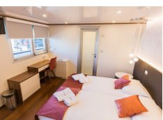
Main or upper deck cabins