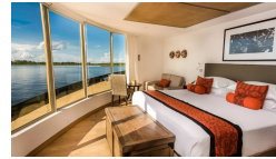
Deluxe Master Suite