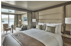
Grand 1 Bedroom