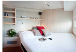
Double Cabin with Sole Occupancy