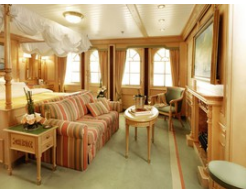
Category A. From

Please note that category F cabins have one lower and one upper berth bed Key Cat A Cat B Cat C Cat D Cat E Cat F