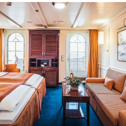
Category C. From