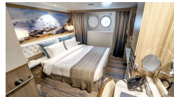
Balcony Stateroom - A