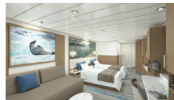
Aurora Stateroom Superior