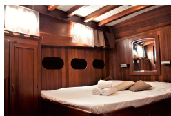
Single occupancy of Double/Twin Cabin