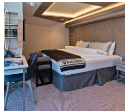
Polar Outside. From