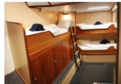
Twin Private Inside