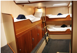
Twin Private Inside