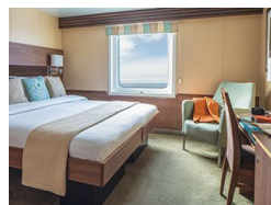
Category 2. From