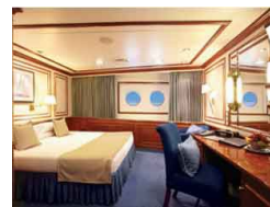
Category 1. From