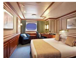
Category 1 Solo