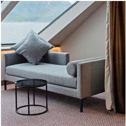
Polar Outside. From