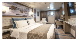
Aurora Stateroom Triple Share