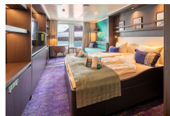
Triple Porthole Twin Deluxe Twin Porthole Twin Window