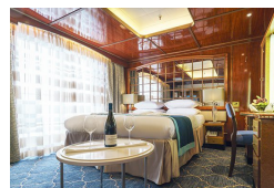
Main Deck Suite