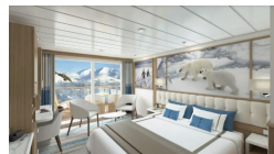
Balcony Stateroom Category B