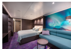
Twin Window - Sole Occupancy