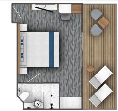
Category C Stateroom - Balcony Stateroom