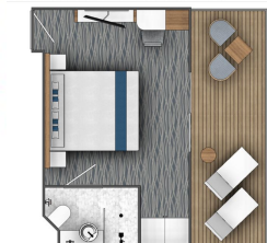
Category C Stateroom - Balcony Stateroom