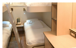
Polar Outside. From