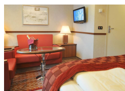
Polar Inside. From