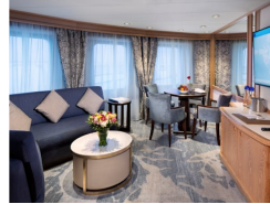
Deluxe Suite - From