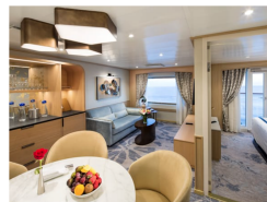
Ocean View - From