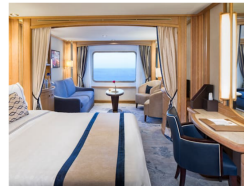
Owners Suite - From