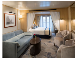
Classic Suite - From