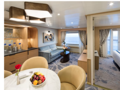
Ocean View - From