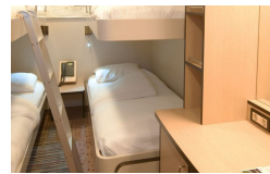
Polar Outside. From