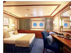
Category 1. From