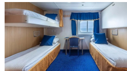
Cabin Category 2