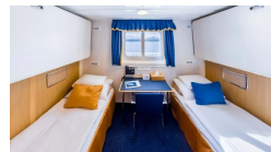
Cabin Category 5