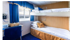
Cabin Category 3