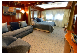
Byrd Deck Superior Sole