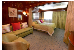
Byrd Deck Superior Suite