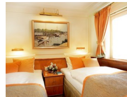
Category 5. From