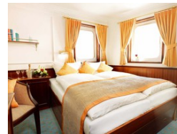
Category 2. From