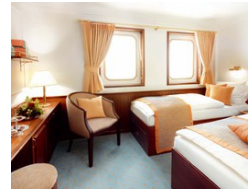
Category 3. From