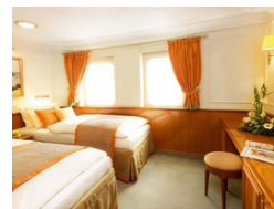
Category 4. From