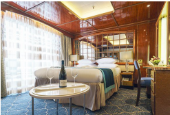
Main Deck Suite