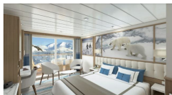
Balcony Stateroom Category B