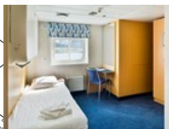
Category 2 Standard Twin