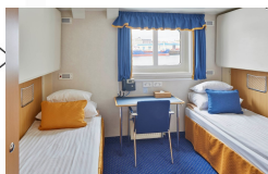
Category 2 Standard twin sole use