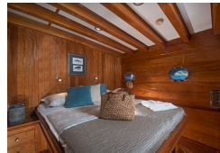
Superior Twin Cabin