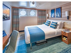
Category 2 Solo