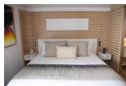
Deluxe Suite Deck 5