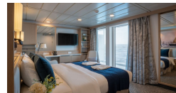
Category C Stateroom