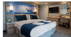
Category D Stateroom