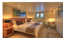
Main Deck B