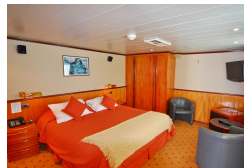
Olympo Deck double/twin cabin