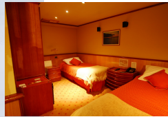
Atenas deck twin/double cabin