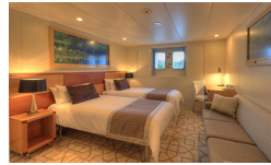
Main Deck B Stateroom