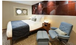
Explorer Deck Balcony Stateroom