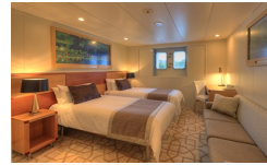
Main Deck B