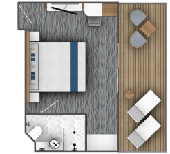
Category C Stateroom - Balcony Stateroom