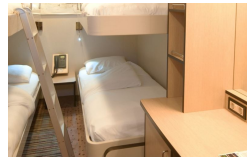
Polar Outside. From