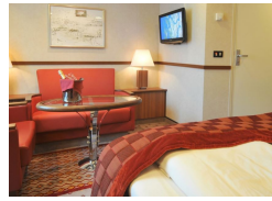
Polar Inside. From