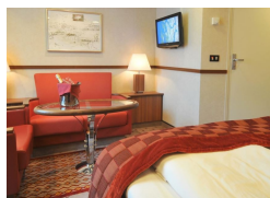
Polar Inside. From