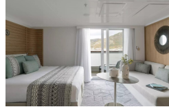
Deluxe Suite Deck 4