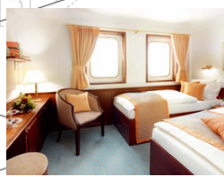
Category 3. From