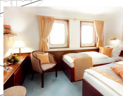
Category 3. From